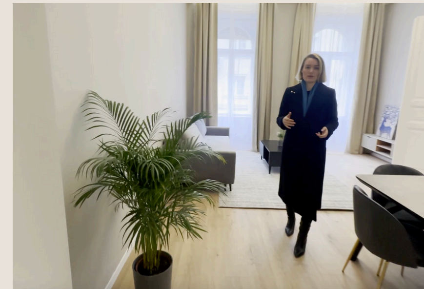
SHORT & LONG-TERM PROPERTY MANAGEMENT