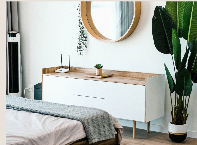
SHORT-TERM & LONG-TERM OUTFIT