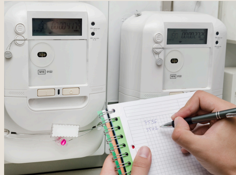
POST SALE SETTLEMENT SERVICE SET UP