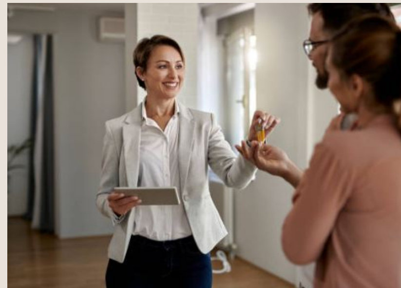
LONG-TERM RENTAL ASSESSMENT, PREPARATION & TENANT SEARCH