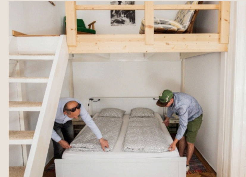
AIRBNB AUDIT, PERMIT & TAX PREPARATION